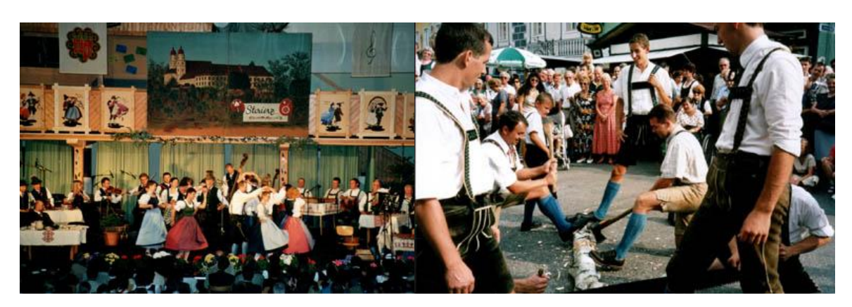
Figure 4: Folk danse group Stainz

promoting the way of life and their culture through dancing on events. Every member is a real "Steirer", talking dialect and also wearing traditional clothes on the weekends and family events. If the group has to travel to an event or organises something, the overheads are covered by the members themselves or are covered through sponsoring from local banks or brewery, who are used to support this group.