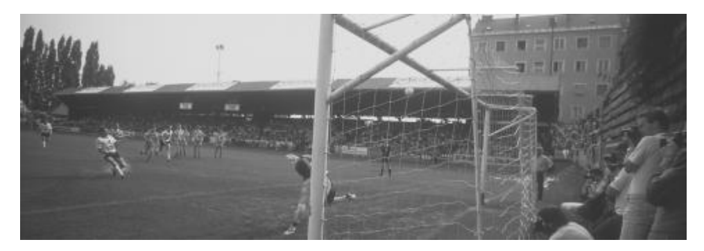
Figure 5: Wooden Football tribune in the centre of Graz

"Social media allows us to get the support of other communities in the world. Its great - how a very small group of interest gets the understanding from people who think the same"