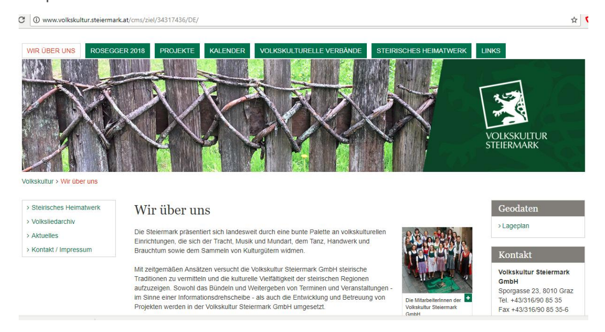
Figure 1: Website of the association Volkskultur Steiermark

By bundling associations marketing can create much more impact, it can be used to attract tourists (e.g. local events with local traditions), and it allows an equal distribution of broader public funding by preserving and supporting local traditions or uniqueness.